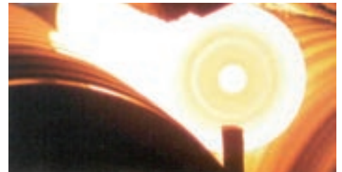
Reiloy's bimetallic barrels are heated with electrical fields covering the entire barrel at once.

Reiloy's high performance and high quality values match our own. That is why Westland is both excited and proud to be able to offer them to you, our customer.